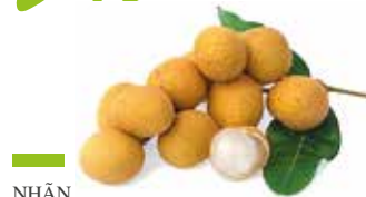
NHÂN (LONG GAN)