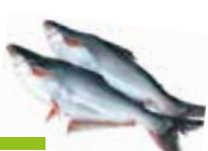
BASA CẮT KHOANH (FROZEN BASA FISH CHUNK CUTTING)