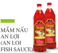
MẮM NẤU AN LỢI (AN LOI FISH SAUCE)