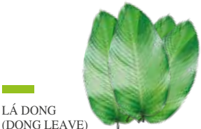
LÁ DONG (DONG LEAVE)