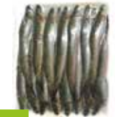
CÁ KÈO (FROZEN KEO FISH)