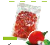
GÁC (BABY JACKFRUIT)