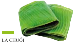
LÁ CHUỐI (BANANA LEAVE)