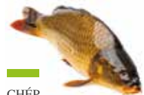
CHÉP (FROZEN CARP FISH)

NeXT JAPAN international Create a future with logistics