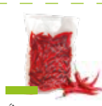
ỚT (FROZEN RED CHILLI)