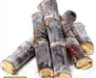
MÍA TÍM (PURPLE SUGARCANE)