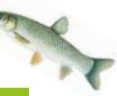
TRẮM CỎ (FROZEN GRASS CARP FISH)