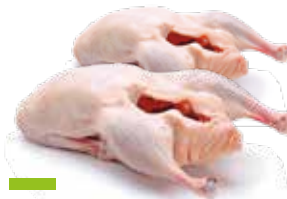
VỊT THÁI LAN KHÔNG ĐẦU (1,8 - 2,0KG) (RAW DUCK GRILLER (1,8 - 2,0KG))