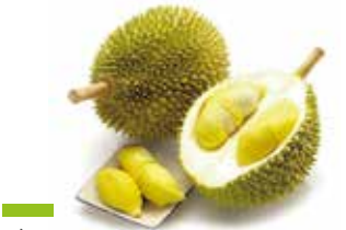
SẦU RIÊNG (DURIAN)