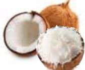
RỪA KHÔ (DRY COCONUT)