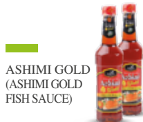
ASHIMI GOLD (ASHIMI GOLD FISH SAUCE)