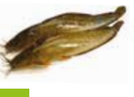
CÁ TRÈ (FROZEN CATFISH)