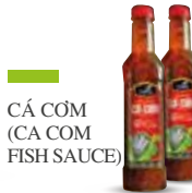
CÁ CƠM (CA COM FISH SAUCE)