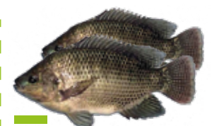
CÁ RÒ PHI (300 - 500g, 500 - 800g) (FROZEN CLEANED TILAPIA FISH) (300 - 500g, 500 - 800g)