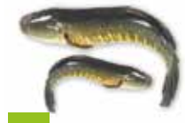
CÁC LỐC (CÁ QUẢ) (FROZEN MUD FISH HEAD CUTTING)